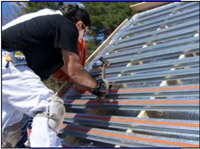
Installing the solar thermal tubing below the Atlantis Energy Sunslates