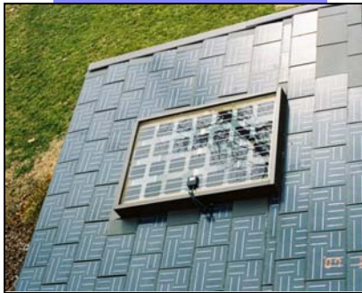
4'x6' integrated photovoltaic glass is used as a skylight over the Pool House, 14W Atlantis Sunslates as roofing.